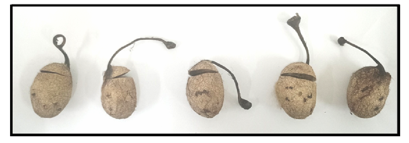
Fig. 2: Cocoon of Sarihan Ecorace

Rearing and grainage performance of Sarihan Ecorace by Regional Sericultural Research Station, Dumka